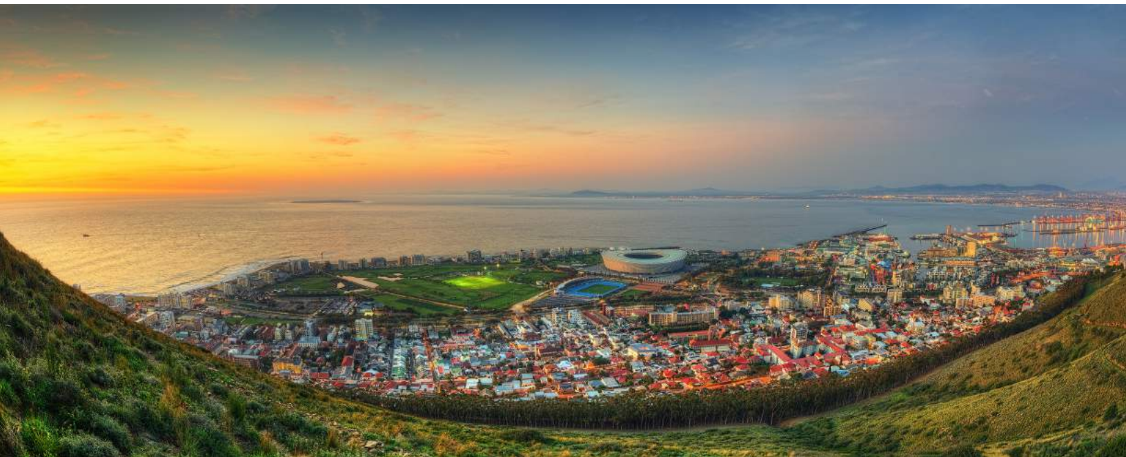
Cape Town, South Africa